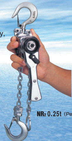
NR2 0.25t (Petit)

The winch hook is equipped with an anti-slip knob. Even if the hook is stretched slightly, the wire rope catches on the anti-slip knob to prevent it from slipping off the hook, ensuring safe operation.