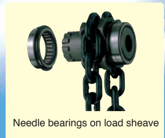
Needle bearings on load sheave